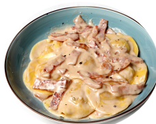
Capelli with foie, bacon and caramelized onion