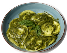
Sorrentino with grana padano cream and spinach